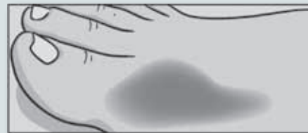
Red swollen toe joint in acute gout

Gout often runs in families because of a genetic connection. Most people with gout have their first attack between the ages of 30 to 40. The majority are men, although women may develop the condition after menopause. This is because the female hormone known as oestrogen can help to excrete uric acid from the body. Other diseases such as diabetes, hypertension, leukaemia, and kidney disorders and certain medications can also cause gout.