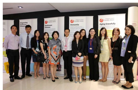
Staff at the Singapore Health Age-Friendly Award Ceremony 2013.

The Singapore Health Age-Friendly Week was initiated by SingHealth in 2012 and aims to raise awareness on the unique needs of elderly patients. ■