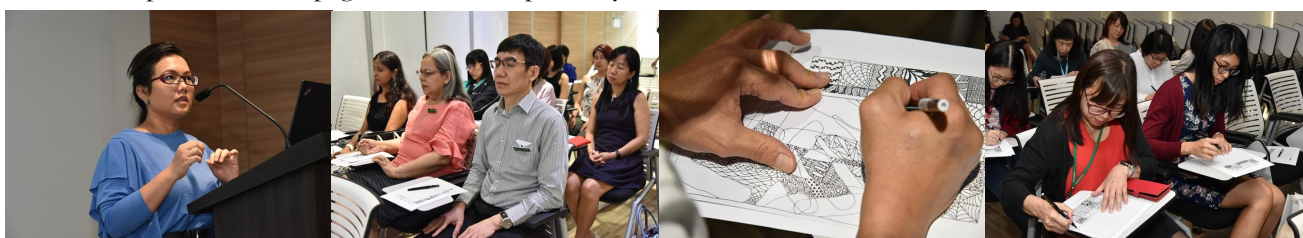
Photos (left to right): Ms Handayani sharing the benefits of art therapy. Participants doing the mini breathing exercise. Participants showing their flair of creativity for the doodling session.

The next talks “ Rejuvenating Compassion ” and “ Office Ergonomics ” will be held in July and September respectively. For details, please refer to page 11 and 13 respectively. ■