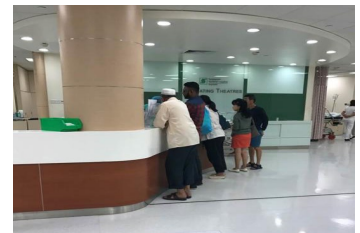
NOKs enquiring about their loved ones at the MOT reception