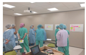
Nurses from different stages of the perioperative process brainstorm using design thinking