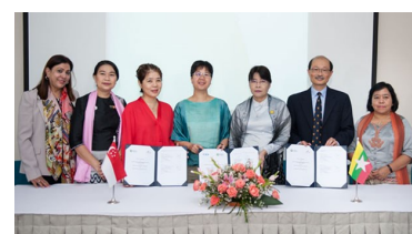
SingHealth, Singapore International Foundation and Myanmar Ministry of Health and Sports signed an agreement to a new training project aimed at helping Myanmar improve its trauma care treatments.

Under the three-year contract, staff from YGH will also visit Singapore on a study trip, where they will learn and exchange knowledge with their various counterparts at local hospitals and polyclinics. ■