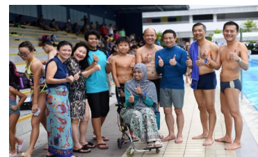
SGH Senior Management and leaders posing for a photo with a patient after their fundraising swim.

A total of 7491 laps were swum by 258 swimmers at the event. You may continue to support the cause by making a donation at this link www.giving.sg/sghhdf/sfr2018 ■