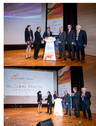
Top and above: Minister Dr Vivian Balakrishnan together with SingHealth and Duke-NUS leaders at the launch of SDGHI.