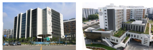
View of Sengkang General Hospital Medical Centre and Sengkang Community Hospital Tower Block

The hospitals are on track to open in the second half of 2018. When fully operational, the Sengkang General and Community Hospitals will have a total of 1,400 beds.