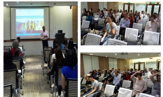
Participants practising the meditation moves.

The next PGMI afternoon talks 'Will Writing and LPA' and 'Introduction to Personal Investment (Major Financial Products)' will be held on 16 May and 4 July 2018 respectively. For more information, please email pgmi.courses@sgh.com.sg . ■