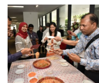
Top: Participants get their hands on tossing “Lo Hei” - a cultural activity held during Chinese New Year for good fortune.