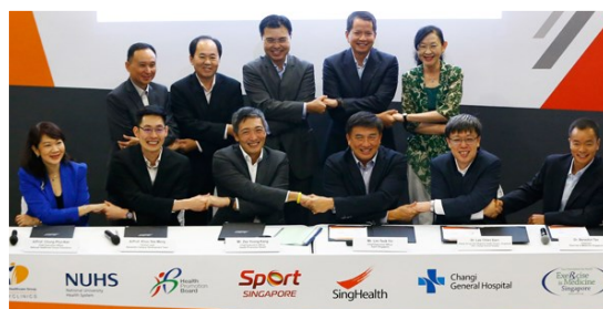
The Active Health MOU signing between Sport Singapore and its partners at the SportSG auditorium at the Singapore Sports Hub.