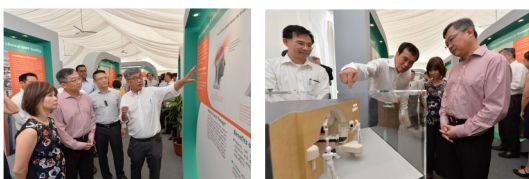
Minister for Health Gan Kim Yong officiated at the groundbreaking ceremony for the NCCS new building at SGH Campus.