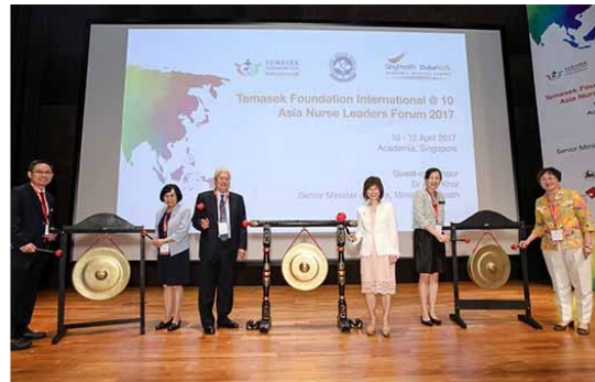
Official opening of Temasek Foundation International @ 10 Asia Nurse Leaders Forum 2017. The Forum was officially opened by Dr Amy Khor, Senior Minister of State for Health and Environment and Water Resources.

The forum was part of a series of forums and networking programmes marking TF Int'l's tenth year of partnerships in building capabilities in Asia and beyond. ■