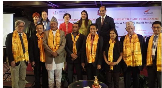
The three-year programme was launched in Nepal on 3 May 2017 by Honourable Minister Gagan Kumar Thapa, Ministry of Health, Nepal and Dr Mohamad Maliki Bin Osman, Senior Minister of State, Ministry of Defence and Ministry of Foreign Affairs, Singapore

On 3 May 2017, the Government of Nepal and SingHealth launched their partnership to train 560 Nepalese hospital leaders, clinician-specialists, nurses and allied health professionals in post-disaster recovery. The three-year training programme aims to equip participants with the expertise to manage emergencies after a disaster to ensure timely response and recovery, as well as develop disaster response systems and protocols to ensure strong governance and preparedness. The programme is supported by almost S$600,000 in grand funding from Temasek Foundation International and to further multiply the impact of the training, 20 clinician specialists will be trained in Singapore as master trainers after completion of the programme. They will in turn train 750 other healthcare professionals in Nepal. Training will commence in June, conducted by a multidisciplinary team of doctors, nurses and allied health professionals from Singapore General Hospital. ■