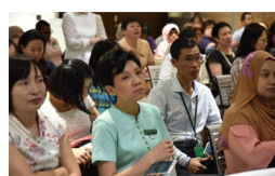
Speaker & participants at the PGMI Afternoon talks.