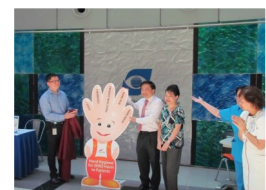
Activities conducted around the campus to celebrate Hand Hygiene Day.