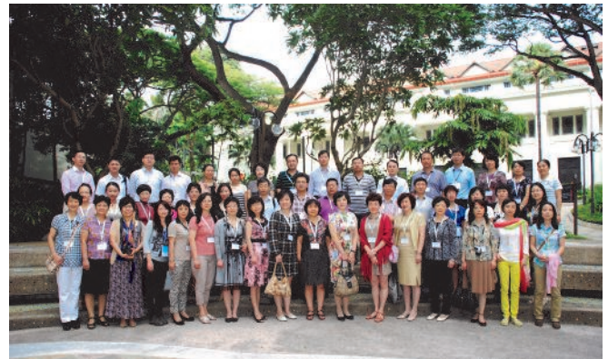
Delegates from Sanofi China on a Hospital Tour