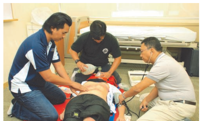
Hands on practice during the ISOS Trauma Life Support Course