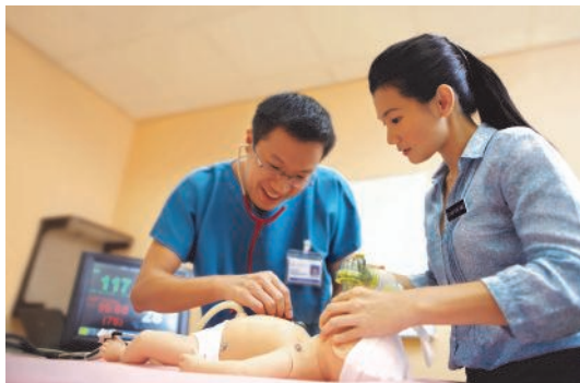
Singapore Neonatal Resuscitation Course

Details: Organised by the Republic of Singapore Navy (RSN) and Singapore General Hospital (SGH), this course aims to advance the awareness and clinical practice of Underwater and Hyperbaric Medicine in Singapore.