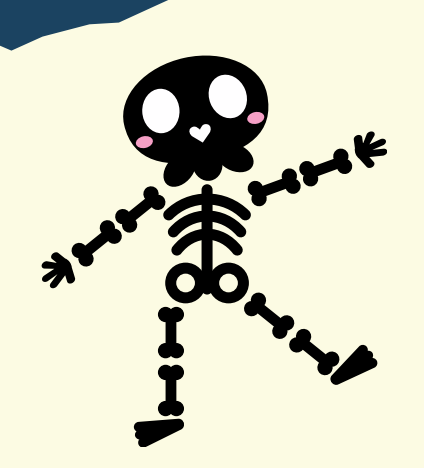
What is Phosphorus? Phosphorus is a mineral that is important for bone health.